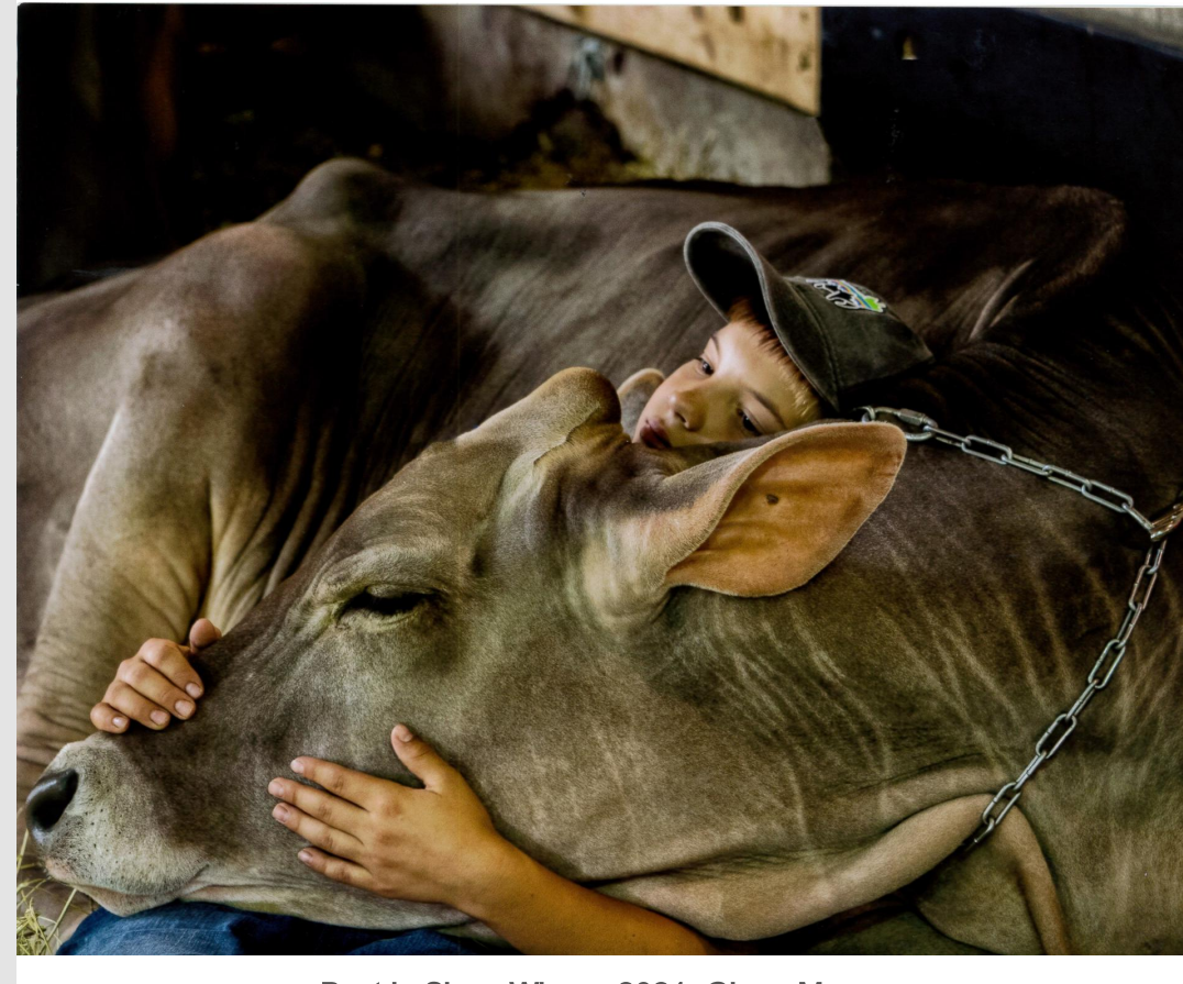
Best in Show Winner 2021: Glenn Meyers

Read all about this popular program at: https://www.wfblibrary.org/at_the_library/photography_contest/